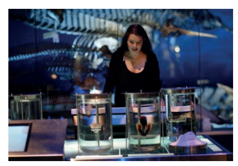
Image credit: Installation view Colossal Squid: Freaky Features!. Courtesy of Te Papa Tongarewan National Museum of New Zealand.

Developed and toured by Te Papa Tongarewa, National Museum of New Zealand.