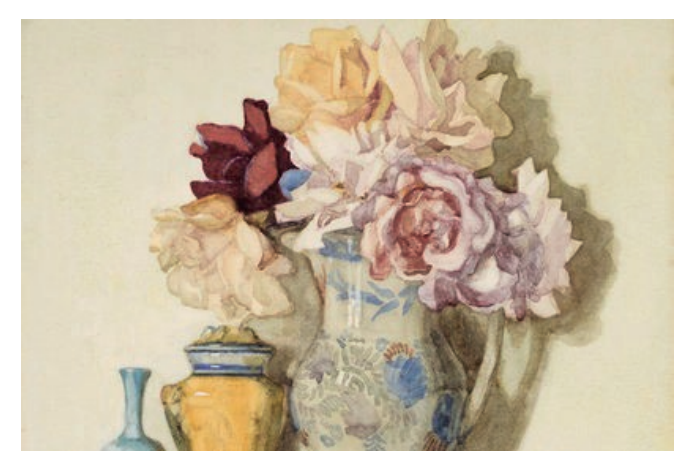
Image credit: Dorothy Kate Richmond, Still Life With Roses. Watercolour on Paper, Collection of Whirinaki Whare Taonga.

Education Visits 17 June – 30 June (continues in Term 3)