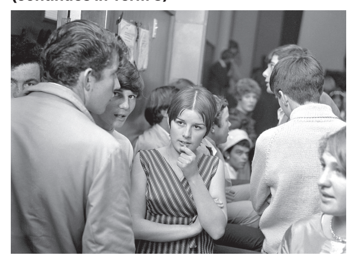
'Fancy Dress Youth Dance,' St Johns Hall, 1969

Education Visits: 8 May – 30 June (continues in Term 3)