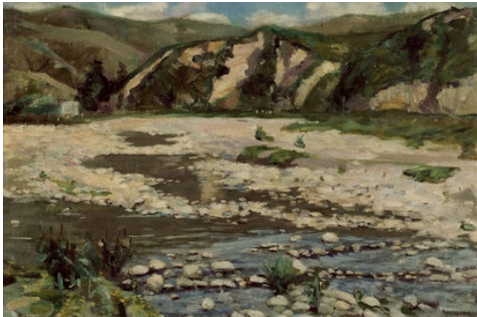
Silverstream by William Tiller

Some artist biographies can be found online using the following links