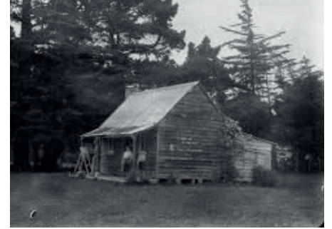
Pumpkin Cottage, 1940